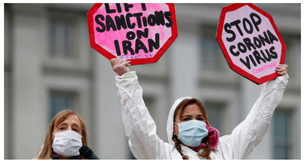
Protesters call for the Trump administration to ease economic sanctions on Iran to help the country's fight against COVID-19, March 11, 2020, Washington, US

As COVID-19 continues to wreck lives and livelihoods across the globe, some countries, such as the United States, seem to be suffering the consequences of this deadly pandemic more than others, largely due to the shortsightedness of their governments.