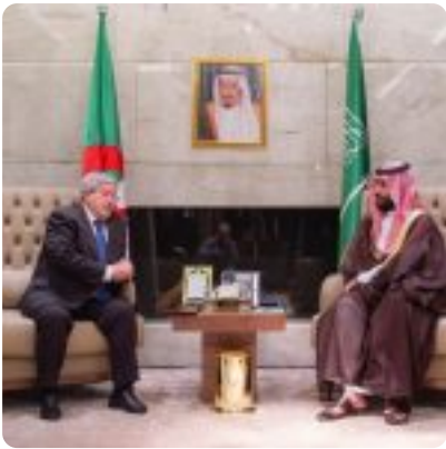
Algeria’s Unrest Unsettles the Saudi/UAE-led Bloc ( https://lobelog.com/algerias-unrest-unsettles-the-saudi-uae-led-bloc/ )