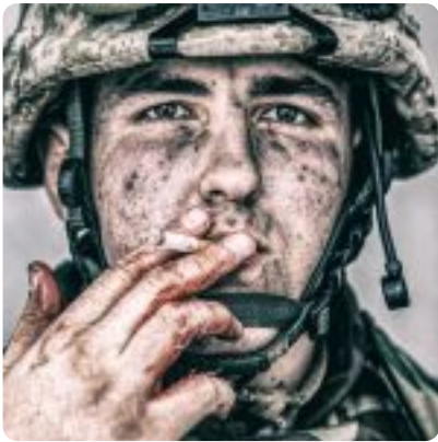
The Forever Wars Go On Without Me ( https://lobelog.com/the-forever-wars-go-on-without-me/ )