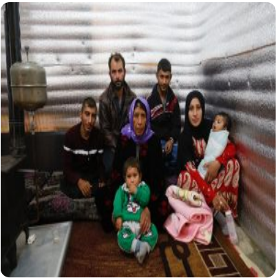
The Future of Syrian Refugees in Lebanon ( https://lobelog.com/the-future-of-syrian-refugees-in-lebanon/ )

We value your opinion and encourage you to comment on our postings. To ensure a safe environment we will not publish comments that involve ad hominem attacks, racist, sexist or otherwise discriminatory language, or anything that is written solely for the purpose of slandering a person or subject.