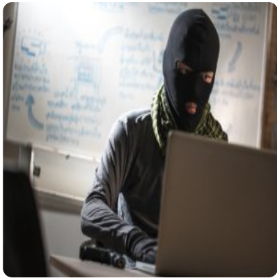
ISIS 3.0: The More Virulent Threat ( https://lobelog.com/isis-3-0-the-more-virulent-threat/ )