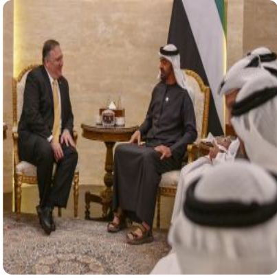
Trump's Doomed Quest for a Middle East Strategic Alliance ( https://lobelog.com/trumps-doomed-quest-for-a-middle-east-strategic-alliance/ )