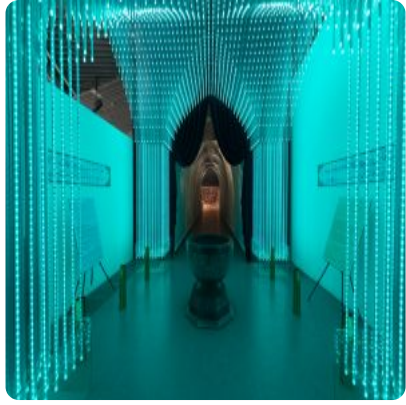
The Lasting Lessons of the Iranian Revolution ( https://lobelog.com/the-lasting-lessons-of-the-iranian-revolution/ )