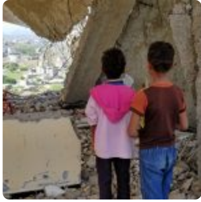
Congress Poised to Move Forward with Bold Agenda on Yemen ( https://lobelog.com/congress-poised-to-move-forward-with-bold-agenda-on-yemen/ )