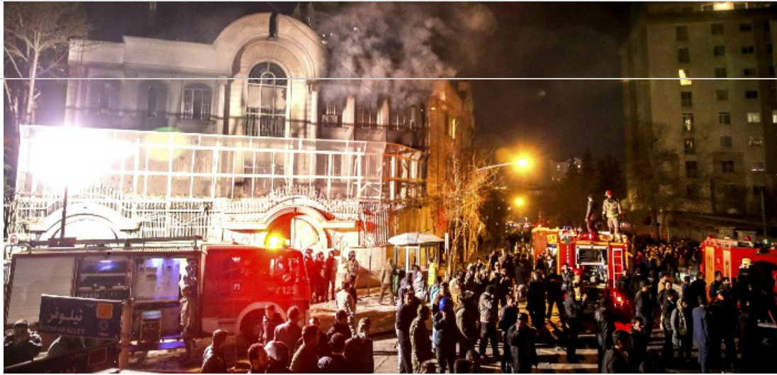
Iranian protesters during a demonstration at Saudi Arabia's embassy in Tehran, Jan. 2, 2016.

New regional and international coalitions are forming with respect to the Middle East and Persian Gulf. An alliance of Donald Trump-led America, Israel, Saudi Arabia, and the United Arab Emirates faces a new coalition of Iran, Russia, Iraq, Bashar Al-Assad controlled-Syria, Hezbollah and grassroots regional forces such as the Popular Mobilization Forces in Iraq and the Syrian Defense Forces. The geopolitical competition between these opposing sides can more specifically be described as between the regional states seeking U.S. security guarantees and the creation and consolidation of a U.S.-led regional security order, and those states—such as Iran, Russia, and Syria—who despite their interests not wholly aligning on all fronts, have the overlapping strategic aim of fostering a multipolar regional order where they each have greater autonomy.