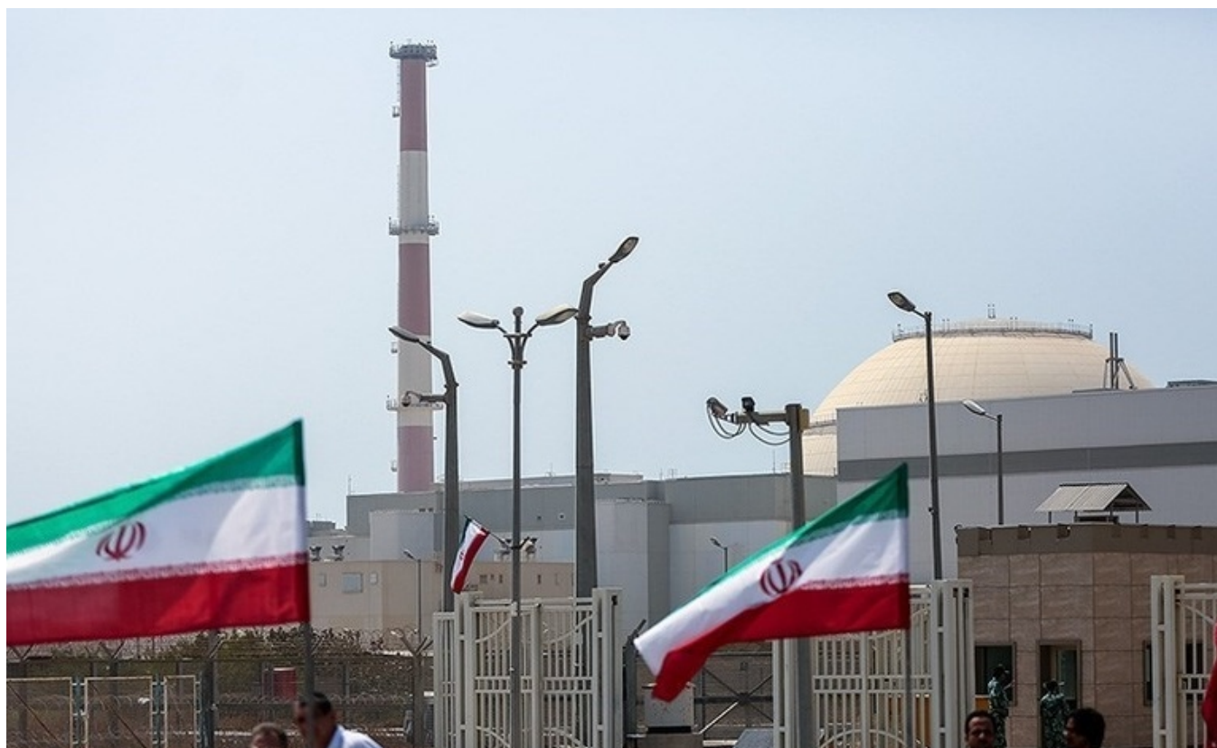
Iran's Bushehr Nuclear Plant.

The White House should realize its three aims with respect to the JCPOA are impossible, foremost because the deal is a multilateral agreement backed by a UN Security Council resolution. Furthermore, each of the three objectives are illogical and counter to international laws and norms. With respect to the expiration of the JCPOA’s major provisions on Iran, the last of which “sunsets” in roughly 25 years, it is important to note that no other country has agreed to the provisions outlined in the JCPOA—which go beyond and are vastly more stringent than the nuclear non-proliferation treaty (NPT). Making these provisions permanent would be akin to creating a new NPT just for Iran, a discriminatory and inherently humiliating demand that Iran would never accept.