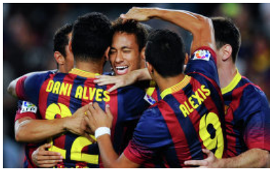
Catalan Football Giant Barca Celebrates 115 Years of Success